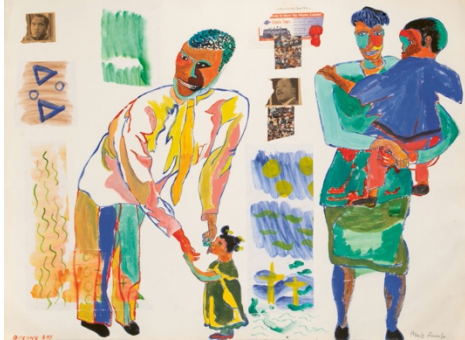
Abel's Family 1999 Acrylic and collage on cold press watercolor paper 22 x 30 in

368 Broadway, Suite 305 New York, NY 10013 (503) 515 8732 carracciart.com @carracci_art