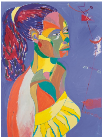
Billie Holiday 2002 Acrylic and collage on Arches paper 30.25 x 22.5 in