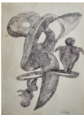
Untitled Ca. 1997 Ballpoint pen on paper Unframed: 11 x 8 in Framed: 14 x 11 in