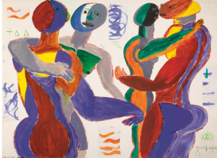
Nourishing Ourselves 1999 Acrylic and collage on cold press watercolor paper 22 x 30 in

368 Broadway, Suite 305 New York, NY 10013 (503) 515 8732 carracciart.com @carracci_art