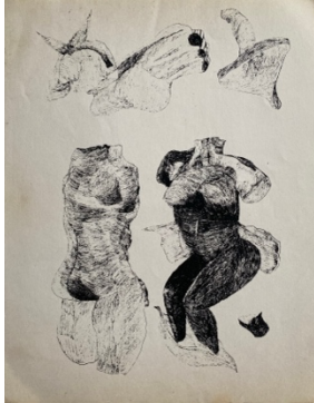
Untitled Ca. 1997 Xerox on cardstock Unframed: 11 x 8.5 in Framed: 14 x 11 in