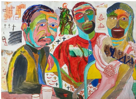
Friends 1999 Acrylic and collage on cold press watercolor paper 22 x 30 in