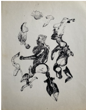
Untitled Ca. 1997 Xerox on cardstock Unframed: 11 x 8.5 in Framed: 14 x 11 in