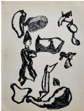
Looking To The Past Ca. 1997 Xerox on cardstock Unframed: 11 x 8.5 in Framed: 14 x 11 in