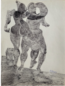
Untitled Ca. 1997 Ballpoint pen on paper Unframed: 11 x 8 in Framed: 14 x 11 in

368 Broadway, Suite 305 New York, NY 10013 (503) 515 8732 carracciart.com @carracci_art