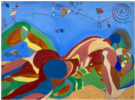
The Couple III 2001 Acrylic and collage on cold press watercolor paper 22 x 30 in