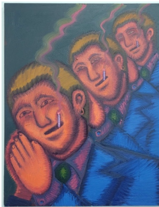
Edward Salas Penitence 2022 Oil on canvas 28 x 22 in $1,000