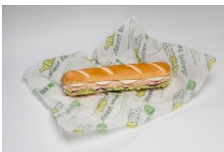
Edward Cabral Subway Tuna Melt 2016 Porcelain, acrylic paint 12 x 4.5 x 4 in $2,500