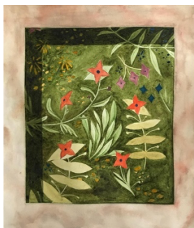
Evan Halter Garden (Stigmata) Study 2019 Watercolor and gouache on paper 10 x 8.5 in Sold