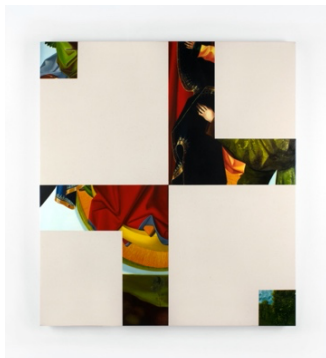
Evan Halter Untitled (After the Master of the Saint Lucy Legend) 2021 Oil on canvas 38 x 34 in $7,500