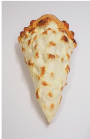
Edward Cabral Bent Domino's Wisconsin 6-Cheese Pizza Slice 2018 Porcelain, acrylic paint 6.25 x 3.5 x 3.5 in