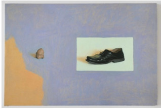
Charlie Goering Shoe 2020 Oil on canvas 24 x 36 in $2,800

368 Broadway, Suite 305 New York, NY 10013 (503) 515 8732 carracciart.com @carracci_art