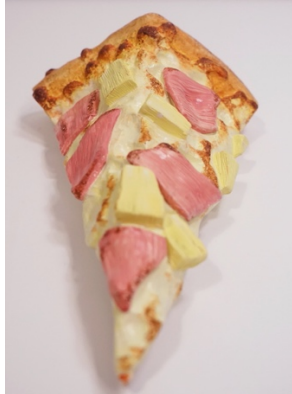
Edward Cabral Bent Domino's Hawaiian Pizza Slice 2018 Porcelain, acrylic paint 6.25 x 3.5 x 3.5 in